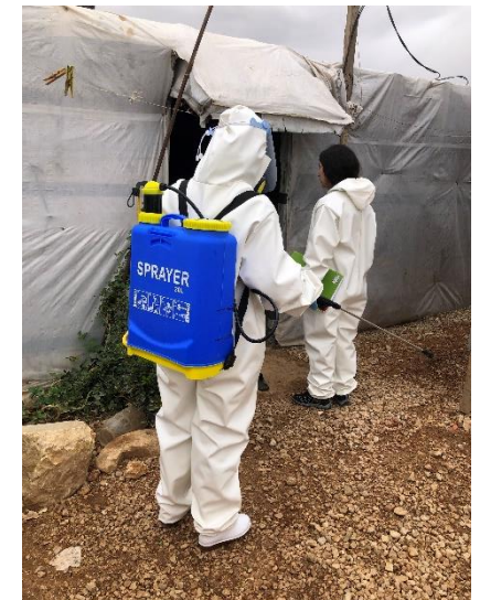
Action Against Hunger officers disinfecting a site with chlorine solution sprayer in Baalbeck-Hermel governorate